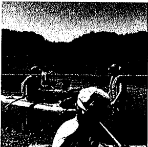
Paddlers remove invasive water chestnut from Ithaca's reservoir, July 2018

Your membership and support have huge impacts on the success of these efforts to protect Cayuga Lake.