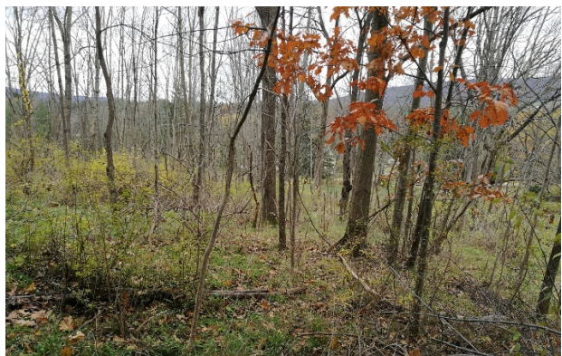
Views from northeast (left photo) and northwest (right photo) corners of property showing emergent forest and brush vegetation on former open land.