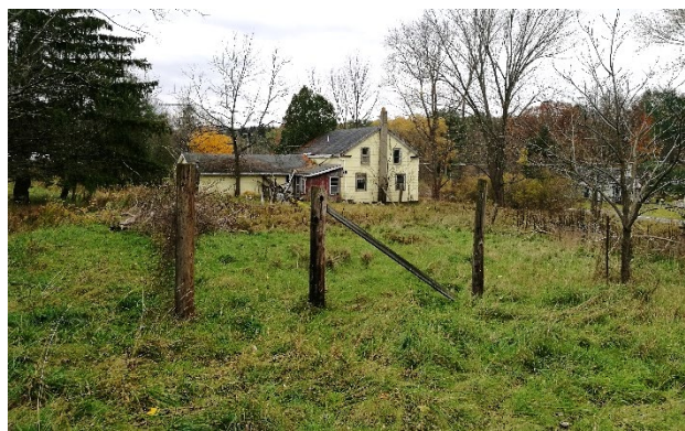
Existing dwelling on site. Proposed driveway to Lot #2 and Lot #3 would be just to the left of the utility pole in left-hand photo. Photo on right is taken from middle of proposed Lot#2.