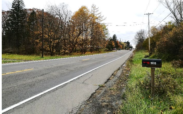
View west along Slaterville Road