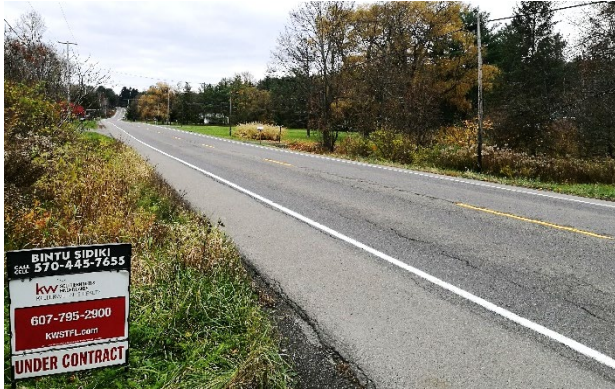
View east along Slaterville Road.