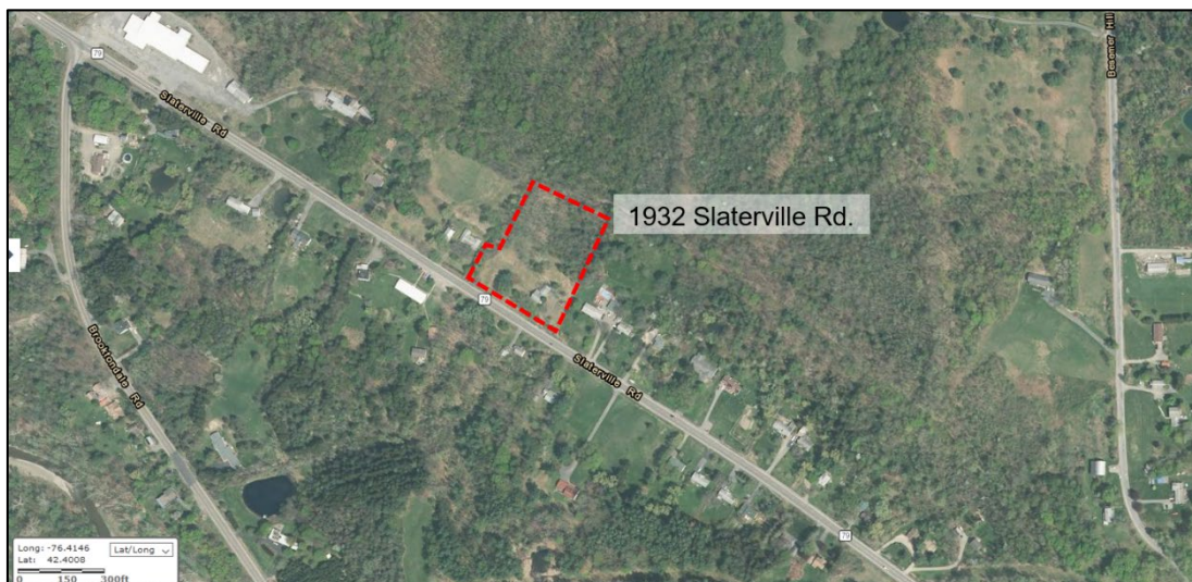
1932 Slaterville Road Site Location Map.

Two (2) of the three (3) proposed lots will conform to the area requirements of the NR-Neighborhood Residential zoning district, however the proposed Lot #3 will not meet the minimum required lot frontage for the NR-Neighborhood Residential zoning district. The lot is proposed to be a flag lot, with a lot width at the street on Slaterville Road of 33.00 feet, where 150 feet is required under the Zoning Law. A variance from the minimum lot width requirement of 150 feet is being requested.