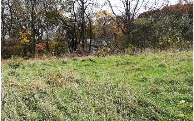
View of 1936 Slaterville Rd. from southeast corner of 1932 Slaterville Rd. and view across proposed Lot #2 toward dwelling at 1926 Slaterville Rd.