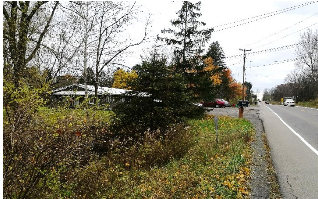
Photo of 1933 Slaterville Rd. (left) and apartment building and parking lot at 1925 Slaterville Rd.