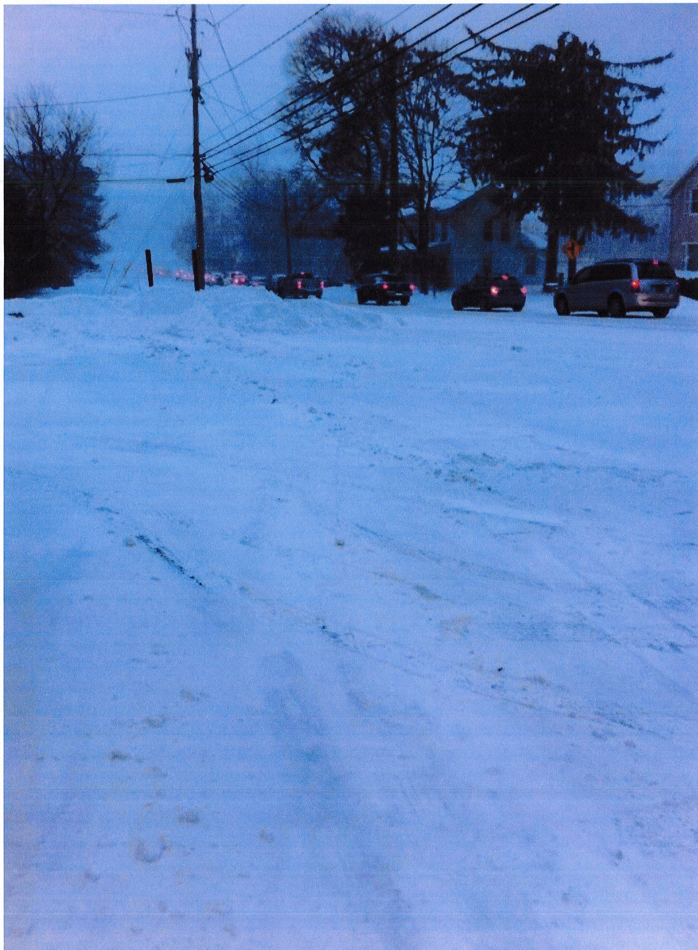
Front off Varna Auto 2014