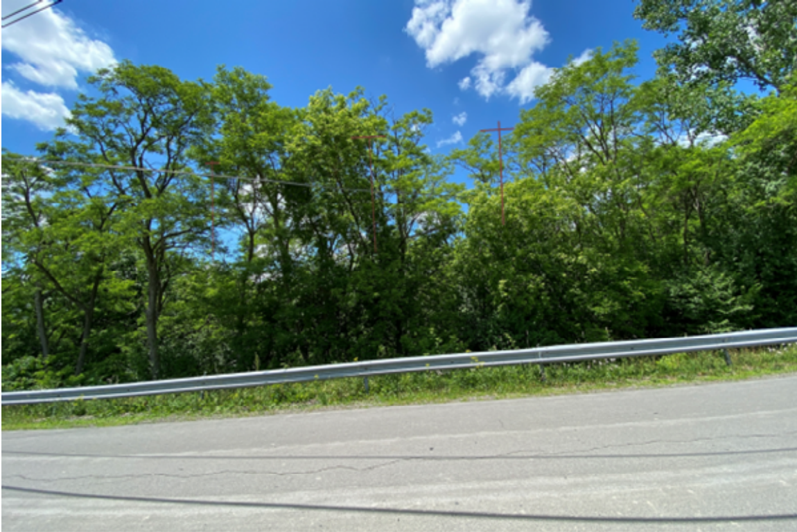
PHOTO 4 FROM IN FRONT OF AUTO BODY SHOP AT 283 GEORGE ROAD

ELEVATION OF ROAD 1078 FEET EYE ELEVATION AT 1083 FEET