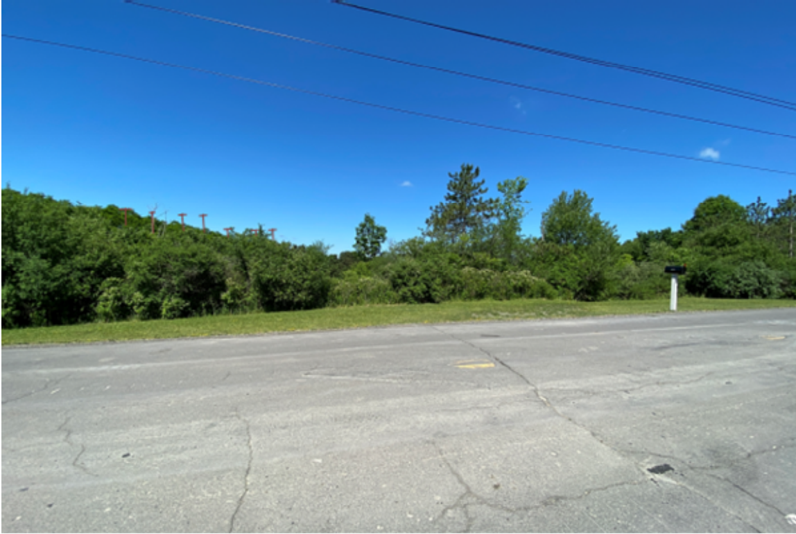
PHOTO 3 FROM DRIVEWAY OF 287 GEORGE ROAD

ELEVATION OF ROAD 1080 FEET, EYE ELEVATION 1085 FEET