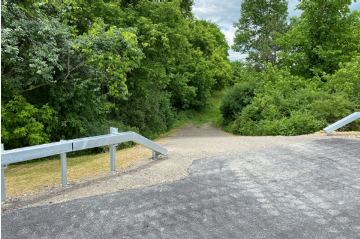
PHOTO 5a. ACCESS ROAD OFF OF GEORGE ROAD EARLY SUMMER

This photo from the same point shows the screening in the summer months.