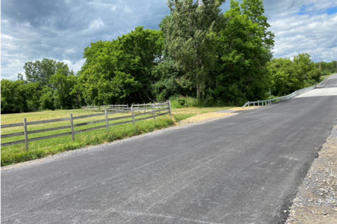
PHOTO 6 LOOKING NORTH TOWARD FROM 150 FEET SOUTH OF BRIDGE

ROAD ELEVATION 1066 FEET, EYE ELEVATION 1071 FEET