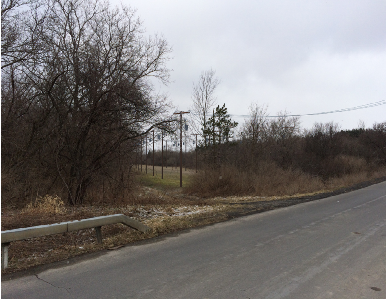
PHOTO 5. ACCESS ROAD OFF OF GEORGE ROAD LATE SPRING

ELEVATION OF THE ROAD AT 1060, EYE ELEVATION AT 1065 FEET