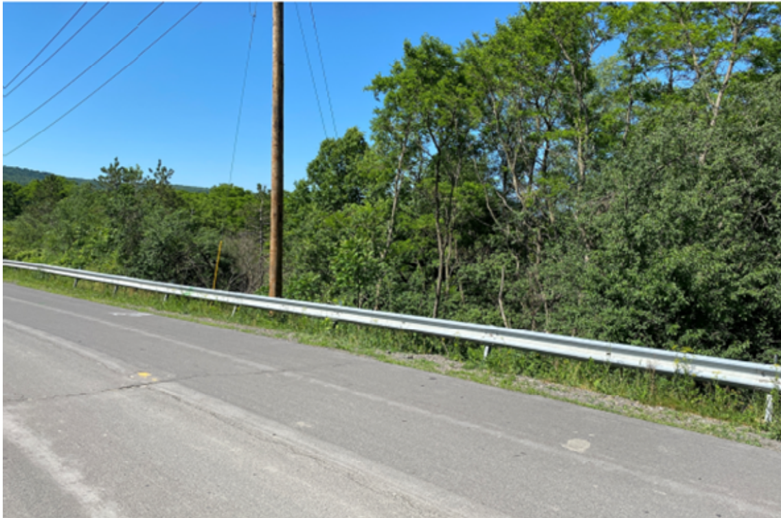
PHOTO 1 LOOKING SOUTH WEST FROM 50 ' SOUTH OF TRAIL CROSSING

ELEVATION OF ROAD 1090 , EYE ELEVATION AT 1095 FEET