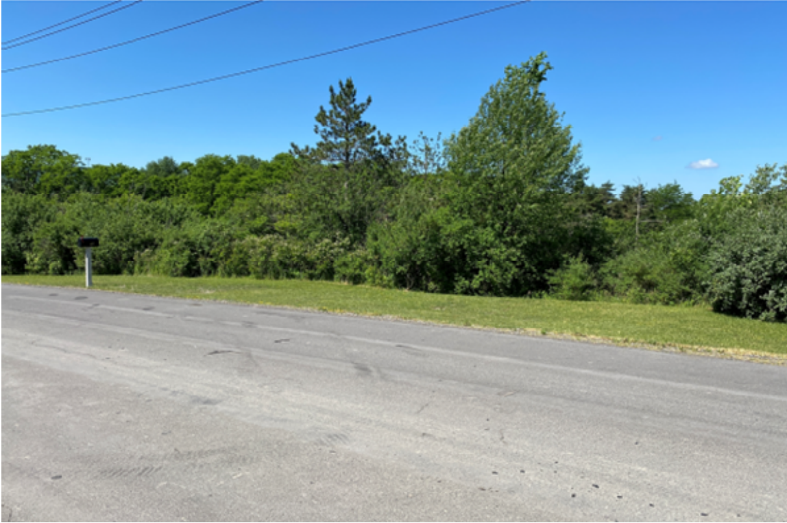
PHOTO 2 FROM ROAD AT NORTH CORNER OF 287 GEORGE ROAD

ELEVATION OF ROAD 1084, EYE ELEVATION 1089