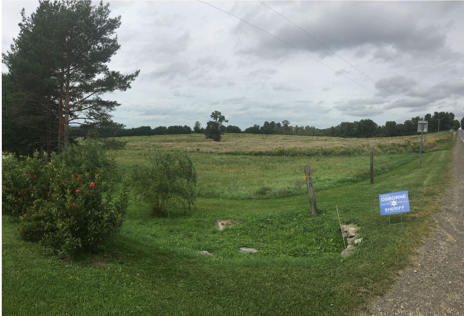
View Shed #2 – approximate elevation 1,040 ft. The tree line that can be seen in the distance has an elevation ranging from 1,050 ft. to 1,061 ft. The maximum height of the buildings, on the site will be approximately 1,035 ft. so the site will be blocked by this tree line.