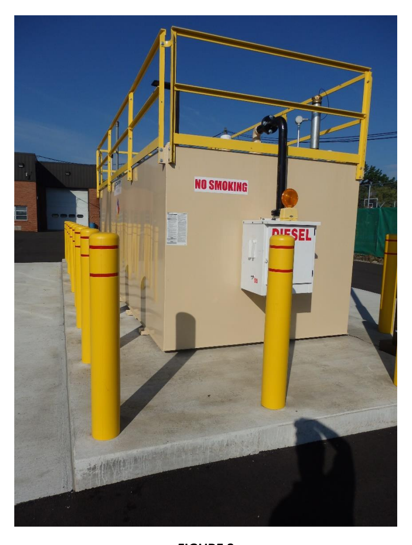
FIGURE 3 Remote fill containment box mounted to tank

Included with this Planning Board Submission are all site civil engineering drawings, and the electrical detail sheet which depicts the location and layout of the proposed LED light fixtures.